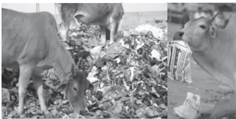
Fig. 10.3: A pile of plastic bags along with leftovers- a cow eating them